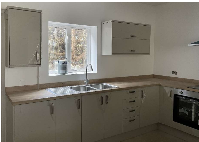
Thanks to the boys at A STAR Kitchens & Carpentry